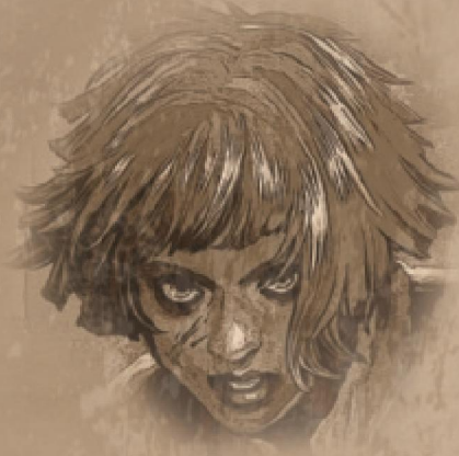
illustration of latest appearance: